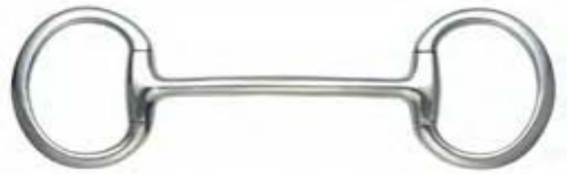
Mullen mouth snaffle