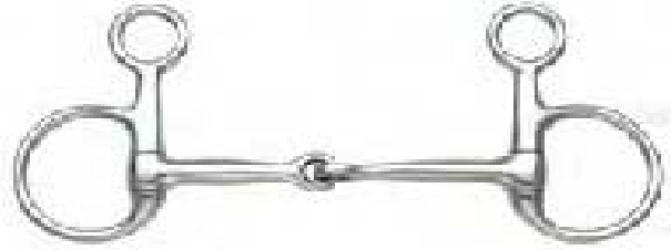
Baucher snaffle – hanging cheek